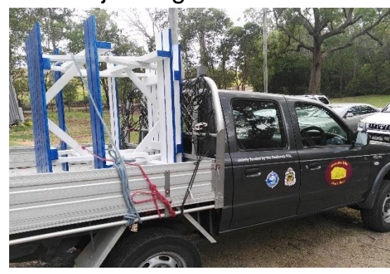
Tables ready for delivery.

"Our local 'Men's Shed' have been working hard to build picnic tables for our Prep students. They have kindly donated labour and most of the materials to create smaller tables that are perfect for our smaller learners. We are very grateful for their time and skills." Project Mgr. Les Burrell