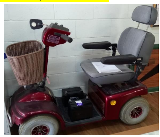
Dates to Remember