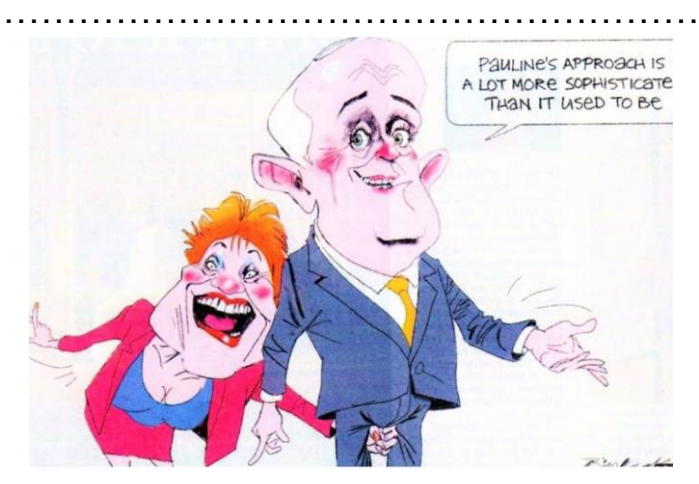
I bet it put a smile on his face ##

Have you noticed that selective deafness seems to gain a form of precedence in the longer one is married or as one ages. Those with actual hearing aids can often get away with a shake of the head or rattling of their battery unit. And a nice smile.