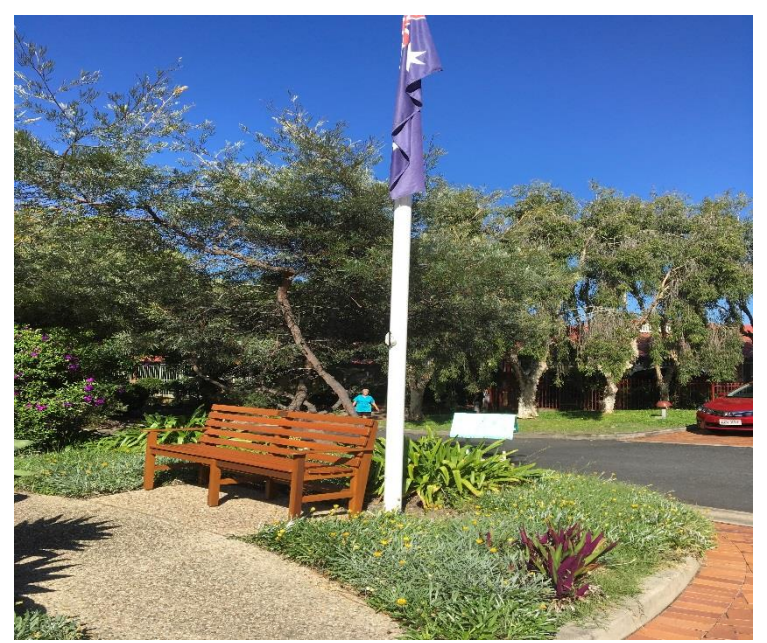
Bench not under load test

A Message from Overseas and a warning of things to cover yourselves with "Medical insurance. "Before you go and you must check what's covered. With so many going on cruises these days you never KNOW.