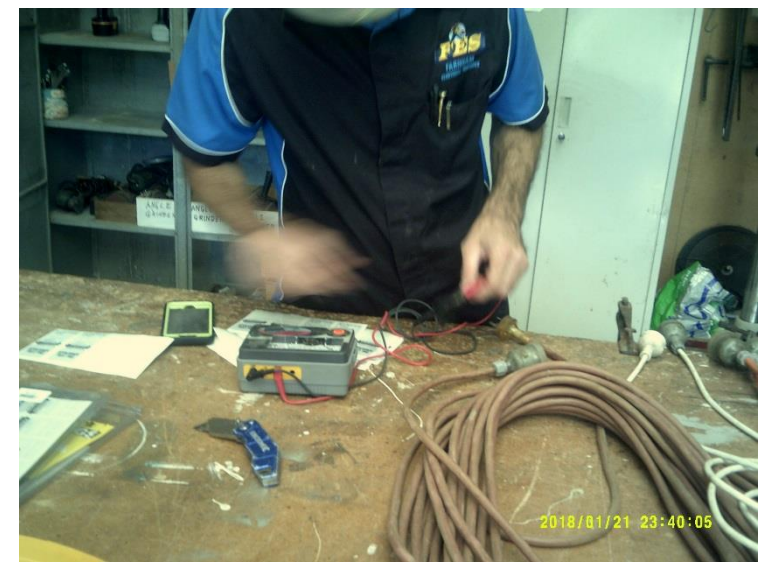
Check for Tags to avoid a shocking discovery.

A lot of donated items have been tested by an approved person and if they did not pass disposed of.