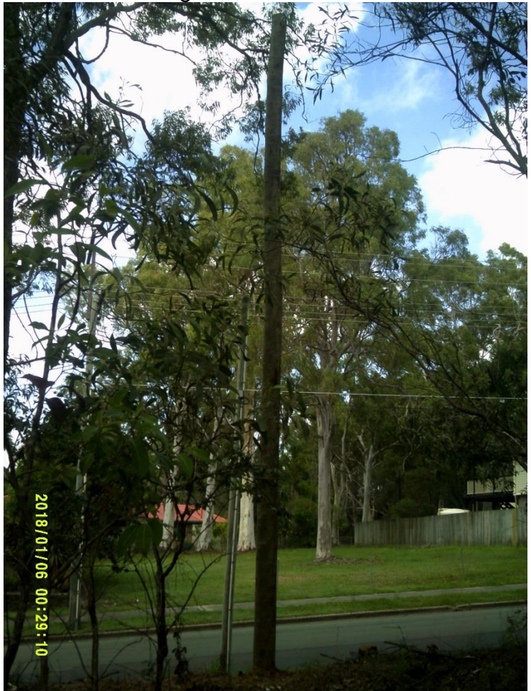
Here is the start of the new power. "Pole up"