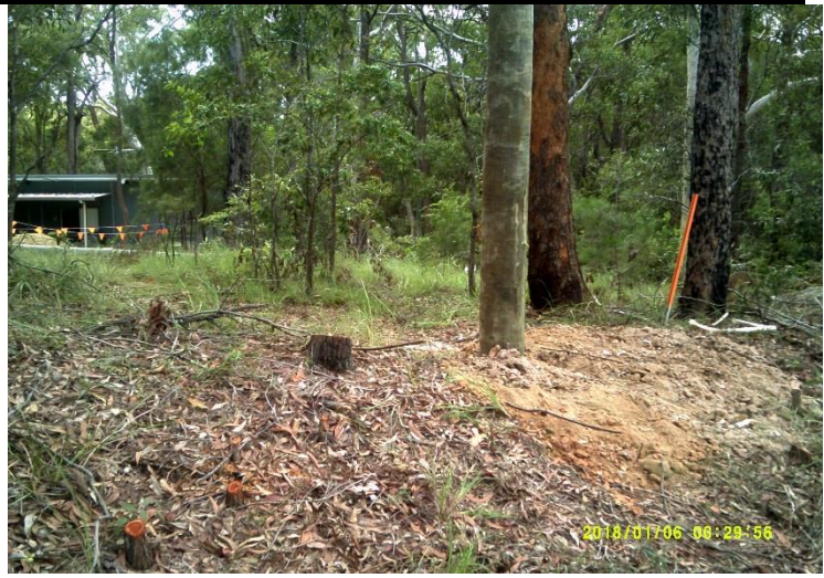
The base of the pole with shed in the background.

Then the Saga really begins. It goes on and on, with the blind leading the blind in seeing we are in need of the power to further our aims of Men's Health and making several contributions to our local society.